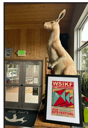
Lost Roo Restaurant and Bar