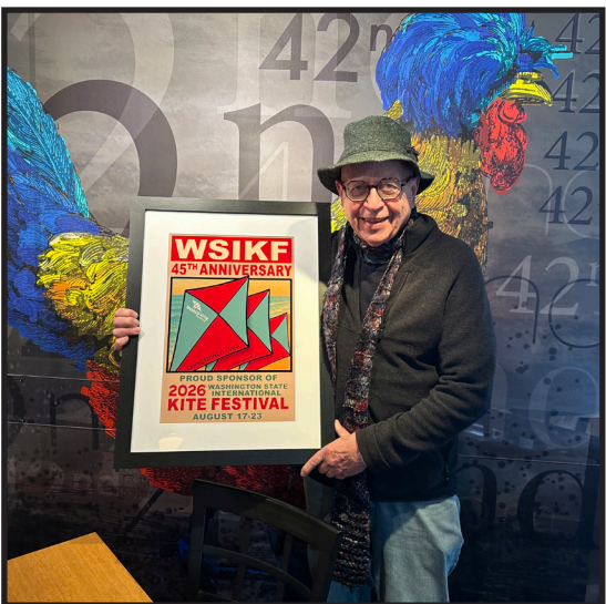
Blaine at 42nd Street Café and Bistro