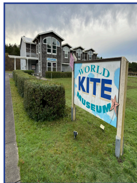
303 Sid Snyder Drive West, Long Beach, WA

W e are excited to invite all registered WSIKF fliers to join us for a special Welcome Reception on Tuesday night, August 18, 2026, at the World Kite Museum. This gathering is our way of thanking the many talented and dedicated fliers who help make the Washington State International Kite Festival such an inspiring and unforgettable event. Enjoy light refreshments, connect with fellow flyers, meet our museum team, and share stories from past festivals as we celebrate the start of an exciting week ahead. Your passion, skill, and commitment bring color, energy, and joy to our skies, and we are truly grateful for everything you contribute to WSIKF. This reception is to honor your creativity and offer a warm welcome to a week filled with memorable flying and shared experiences.