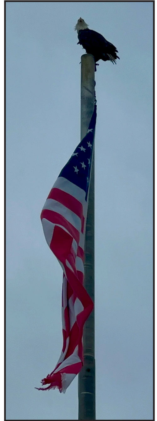
Long Beach, WA resident Bald Eagle can be frequently spotted early mornings

During our recent WSIKF debrief meeting, one recommended change was to limit flying in front of the camps to smaller single-line kites. This adjustment addresses safety concerns caused by sport kites flying over spectators. We have also reduced the distance between the camps and Field "A." Please note this does not reduce the area designated for parking and camps. Camps will still have plenty of room, with 100 feet allocated for their setup, along with an additional 100 feet of clear space before Field "A." Below Fields "A" and "B," we have expanded both the length and width of the sport-kite and multi-line flying areas.