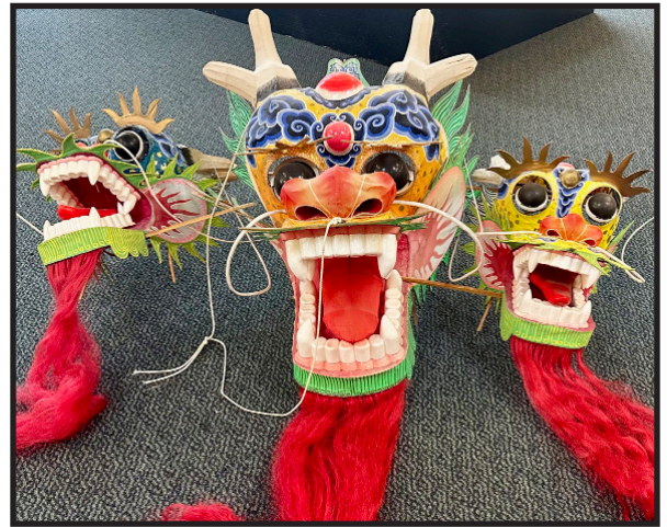
The 200-foot, three-headed dragon will soon stretch across the length of the museum