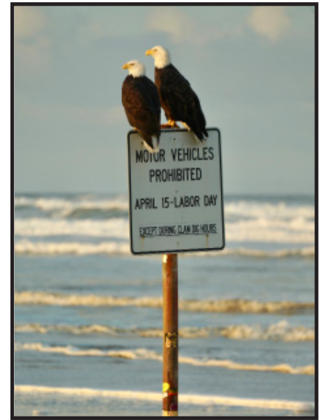
If approved, special parking passes will be required to park on south side of field “B”

For the large single-line kite area on the north side of the road, we are finalizing the layout now and will share full details in our next newsletter.